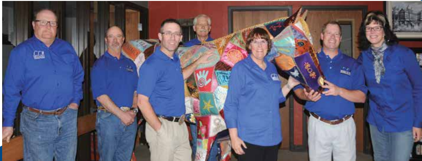
2015-2016 BOARD OF TRUSTEES

Serving as Trustees is incredibly rewarding both from a personal enrichment perspective and from a community enrichment perspective.